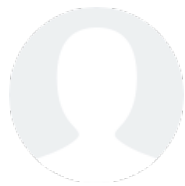
Thomas Resource One Realty, LLC