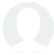
Amy Roberts Homes and Real Estate