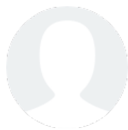
Brooke Roberts Homes and Real Estate