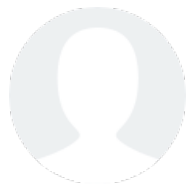
Ryan Corbett Realty

Don't miss your chance to build a home in the highly sought after Kimberly School District. Property is under construction. Photos are of similar property. Est. completion of August 2025