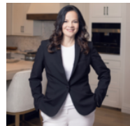
Sarah Adashun Jones, Inc.