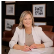
Jan Adashun Jones, Inc.