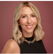
Christine Adashun Jones, Inc.