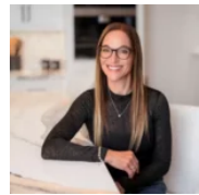
Jodi Adashun Jones, Inc.