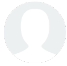
Brooke Roberts Homes and Real Estate