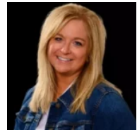
Colette Adashun Jones, Inc.