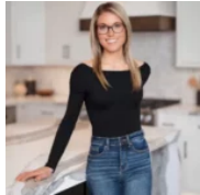
Jada Adashun Jones, Inc.