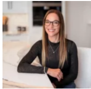
Jodi Adashun Jones, Inc.