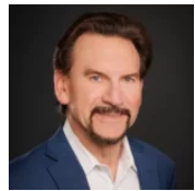
Frank Adashun Jones, Inc.

Country hideaway! 4 bedroom dwelling and several outbuildings on nearly 2.5 acres, surrounded by open fields and trees. Quiet and serene setting just minutes from Ripon, Oshkosh, and FDL.