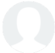
Amy Adashun Jones, Inc.