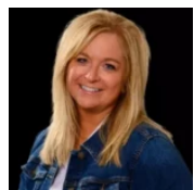
Colette Adashun Jones, Inc.