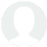
Tiffany Coldwell Banker Real Estate Group