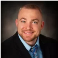
Steven Adashun Jones, Inc.