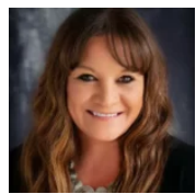
Maureen Adashun Jones, Inc.