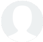
Amy Adashun Jones, Inc.