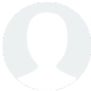
Brooke Adashun Jones, Inc.