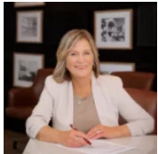
Jan Adashun Jones, Inc.