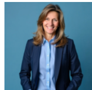
Gail Adashun Jones, Inc.