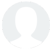
Tyson Adashun Jones, Inc.