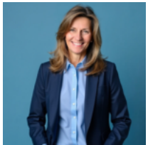
Gail Adashun Jones, Inc.