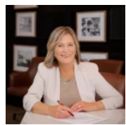
Jan Adashun Jones, Inc.