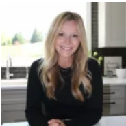
Kelly Adashun Jones, Inc.