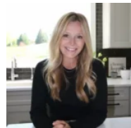
Kelly Adashun Jones, Inc.