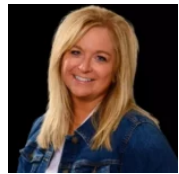
Colette Adashun Jones, Inc.