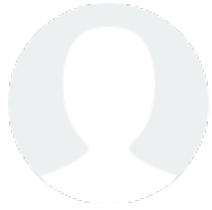
Jason Zellner Real Estate