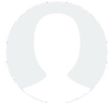
Mike Symes Realty, LLC