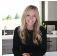
Kelly Adashun Jones, Inc.