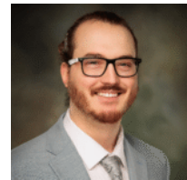
Nathan Adashun Jones, Inc.