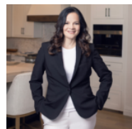
Sarah Adashun Jones, Inc.