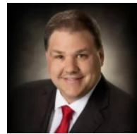
Chris Adashun Jones, Inc.