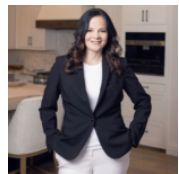
Sarah Adashun Jones, Inc.