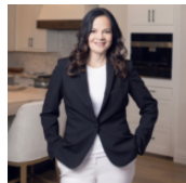
Sarah Adashun Jones, Inc.