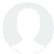
Mike Acre Realty, Ltd.