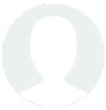
Mike Acre Realty, Ltd.