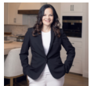
Sarah Adashun Jones, Inc.