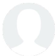
Bobbi First Weber, Inc.