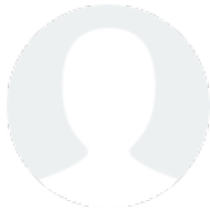
Robbie Dallaire Realty