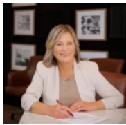
Jan Adashun Jones, Inc.