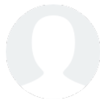
Ben Ben Bartolazzi Real Estate, Inc