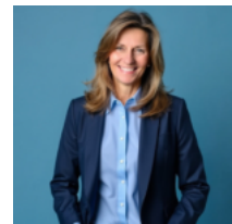
Gail Adashun Jones, Inc.