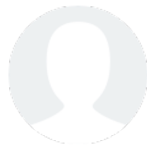
Brian Sweetwater Real Estate, LLC