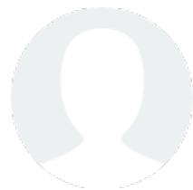
Jill Vision Realty & Development