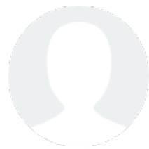
Jill Vision Realty & Development