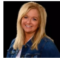
Colette Adashun Jones, Inc.