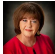
Vickie Adashun Jones, Inc.