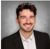
Ben Adashun Jones, Inc.