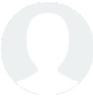
David Ruesch Realty