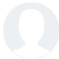
Jason Zellner Real Estate