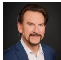
Frank Adashun Jones, Inc.