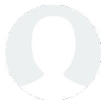
Walt First Weber, Inc.